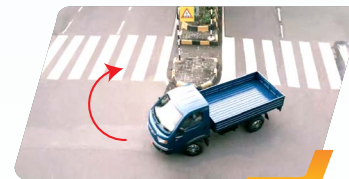
BEST-IN-CLASS TURNING CIRCLE RADIUS