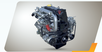
59kW (80 HP) POWER AND 190 NM TORQUE