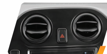
AC OPTION AVAILABLE