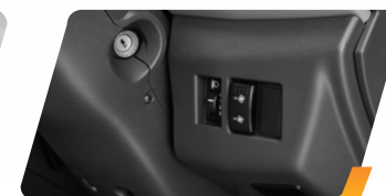
HEATER OPTION AVAILABLE