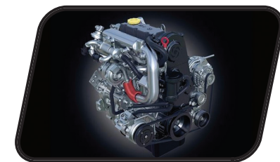
SUPERIOR 70 HP POWER & 170 Nm TORQUE