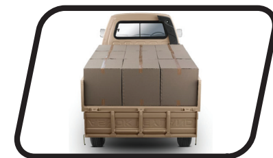
LARGE LOADING AREA