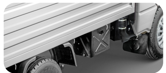
LOCKABLE BATTERY COVER