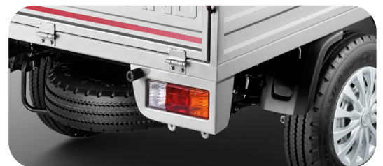
TAIL LAMP PROTECTOR