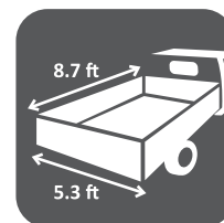
4.28 SQ.M LOADING AREA